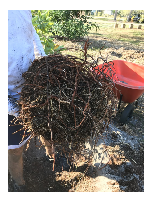
A badly potbound canistel tree; its roots are too dense even after freeing and pruning.

Flood-intolerant species such as avocados are best planted on very large mounds a foot or more in height, if you can manage that.