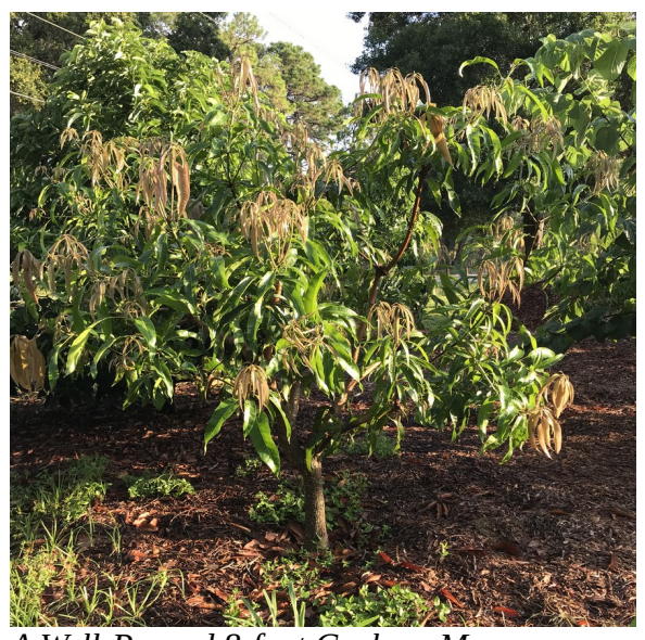
A Well-Pruned 8-foot Graham Mango